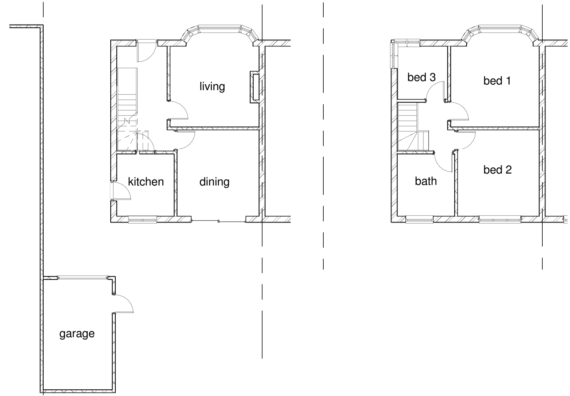
4 Existing Ground Floor Plan 1 : 100